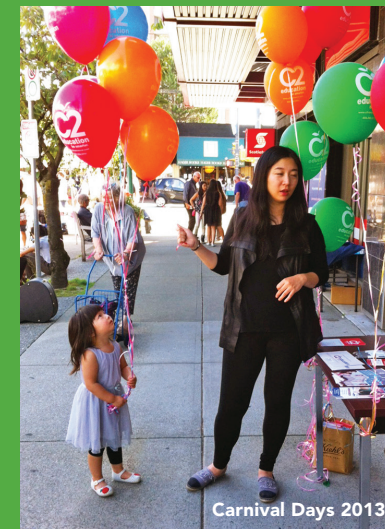
Carnival Days 2013

For new businesses that are not familiar with Carnival Days here's the gin on the event. Friday April 25 is the start of the sidewalk sales weekend where shops proffer up specials from quick bites and sips to slashed prices on clothing, books, linens, electronics and much, much more. We collectively hope for clear and warm climes but it's all a go regardless of the weather. A Steel Band starting at noon will be playing under the clock while a face painter and balloon making clown will rove the Village. Saturday April 26 starts at 10 am with the annual Kerrisdale Little League Parade down West 41st Avenue featuring 4 marching bands, antique cars etc. See below. Main stage bands will be spotted throughout the area as well as a juggler, giant slide, face painter and new this year, a Giggle Photo Booth , where posers will leave with a free special photo memento of Carnival Days. Join the fun!