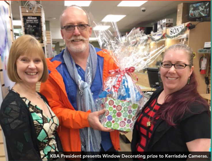
KBA President presents Window Decorating prize to Kerrisdale Cameras.